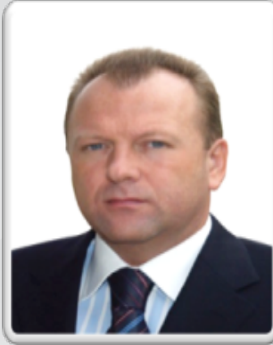
Marius L. VIZER IJF President